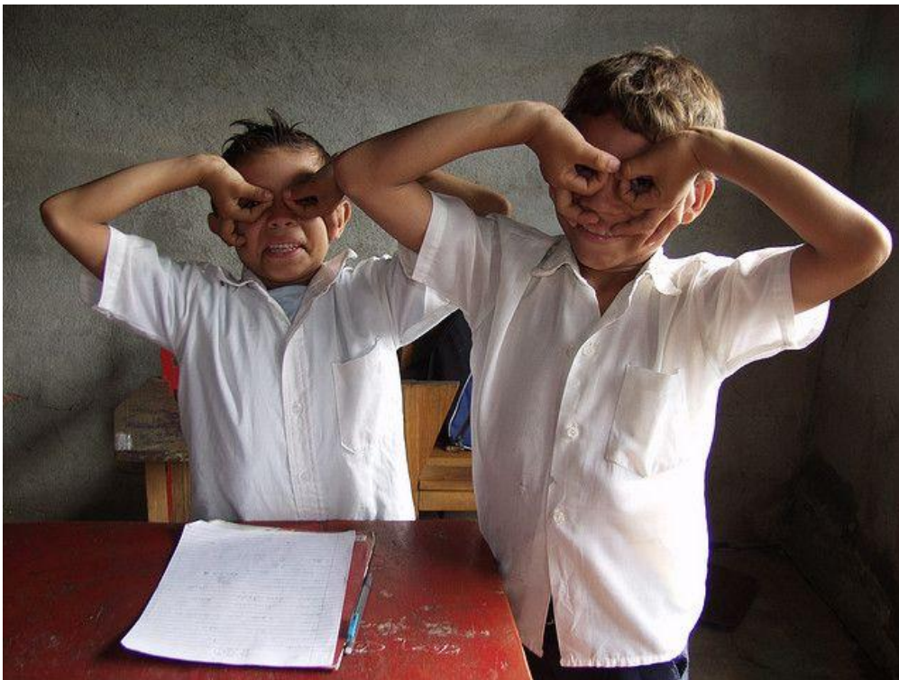
Two students at the Jezreel School in Anexo Primavera.

Christmas is only a few weeks away. Many of you dread braving the weather, traffic, and crowds and heading to the mall. This year, SchoolBOX is offering you the opportunity to give the Gift of Education. You can feel confident that your gift will be original. It will also help the children of Nicaragua better themselves through education.